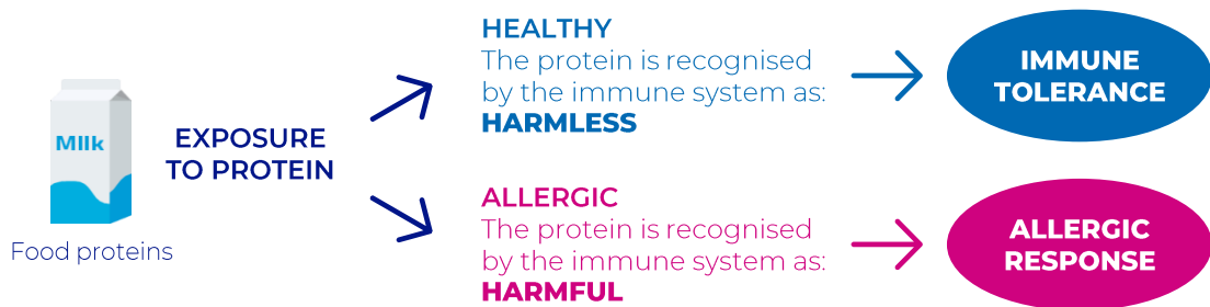
Figure 2: Immune response following exposure to milk protein:

Nutrition plays a role in reducing the burden of allergy in infants through training the immune system. Nutricia’s new research program investigates the efficacy pHF with synbiotics to reduce the risk of developing allergic manifestation by a dual approach: